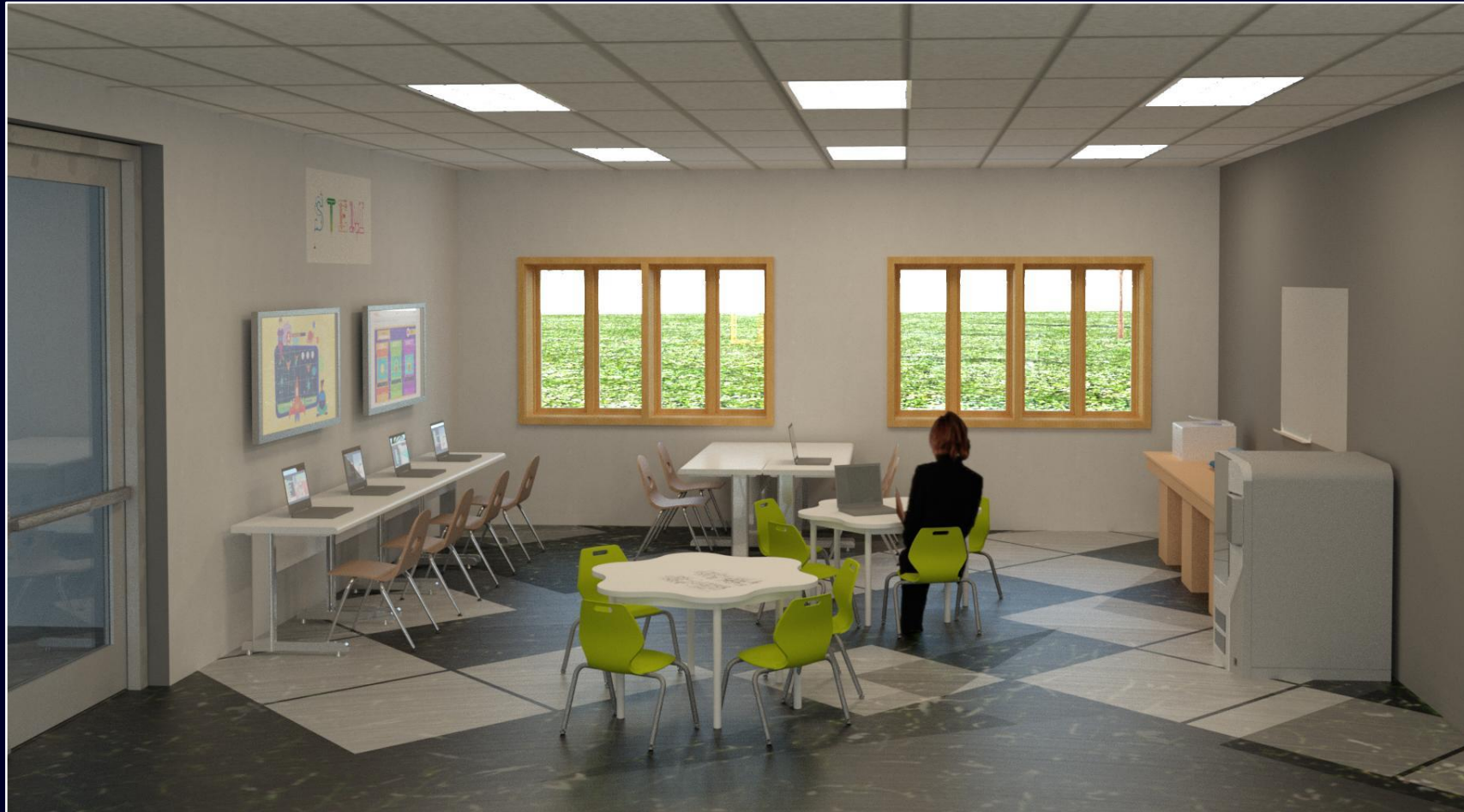
STEM Computer Room